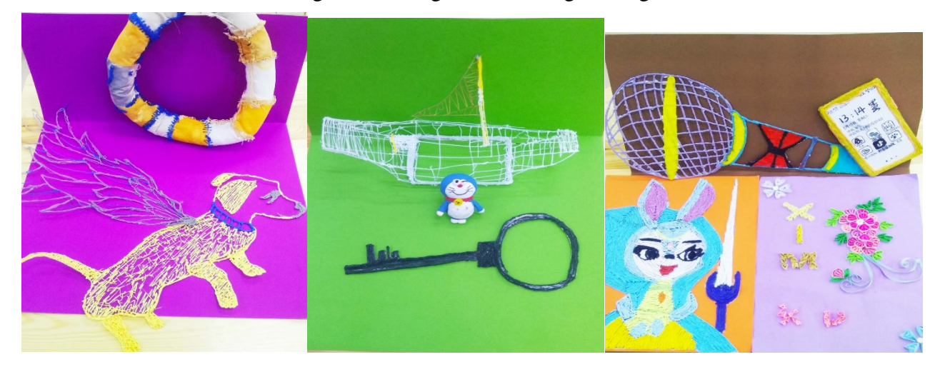
Fig. 4 The products of solution